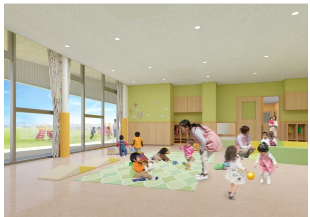
In-office day care center