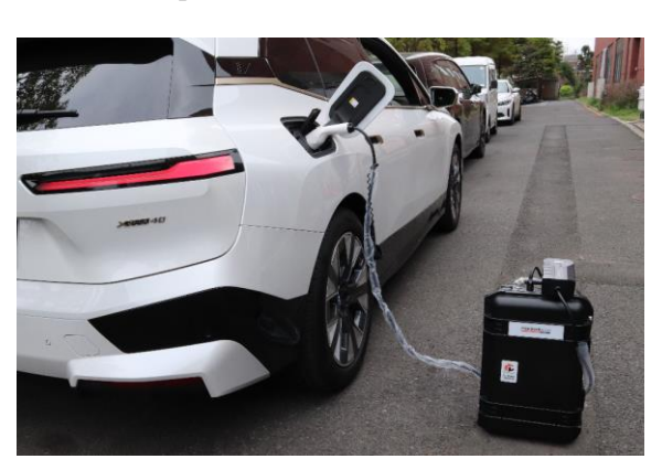
Portable battery charger